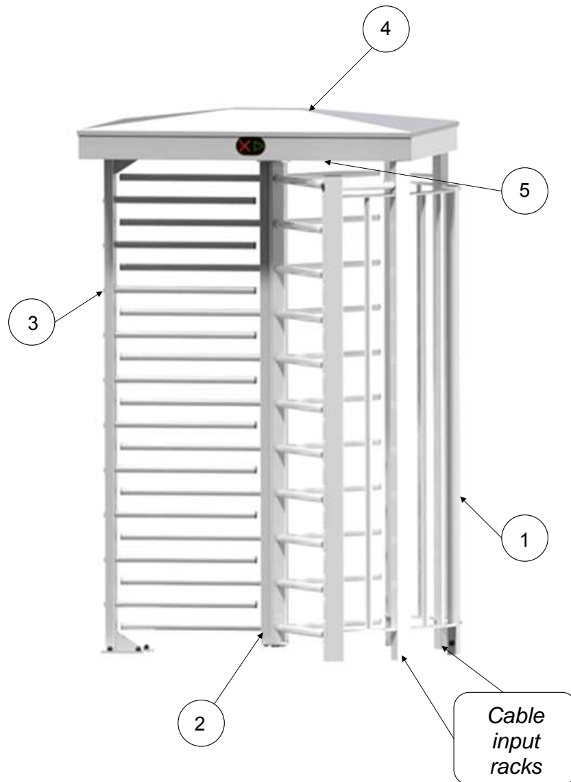
Fig. 1. General view of the turnstile

The said options are defined by orientation of the rotatory shaft during its installation in the course of installation of the turnstile. In the future depending on operating features of the turnstile the gateway modes shall be switched into non-gateway modes and vice versa by re-installing the turnstile rotor.