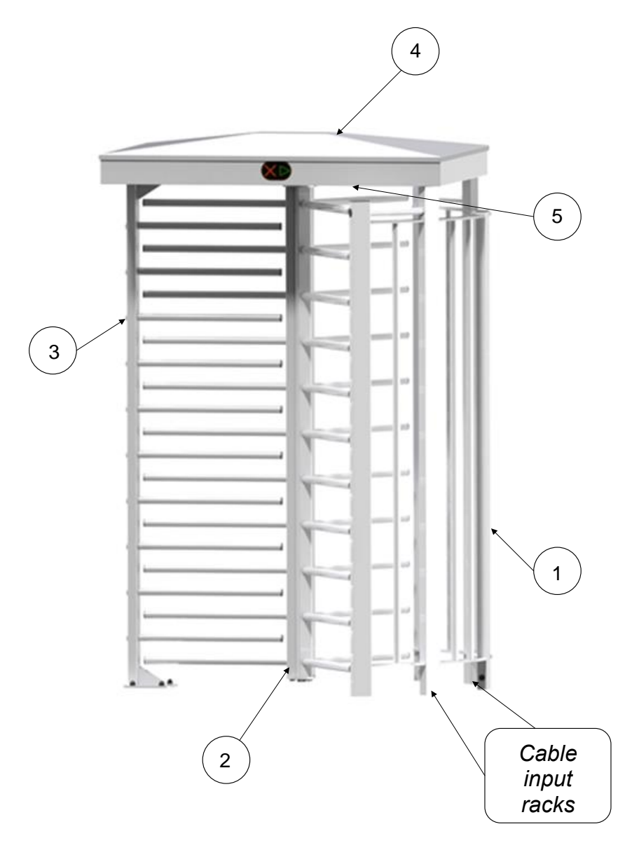
Fig. 1. General view of the turnstile